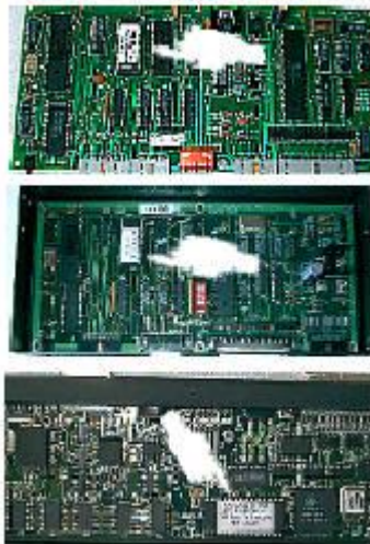
The location of the EPROM's on each type of processor

If your processor has the blue ribbon connector and a Db15 computer like connector on the end going into it, and it has a MIDI input. Your up to date and only need a 1.51K EPROM if you upgrade to CHILI.